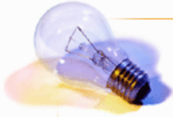
Chart analysis through four step